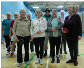
Table Tennis/Badminton meets every Monday during term time, at Todmorden Sports Centre, at 3:00 pm. Cost £3/session.