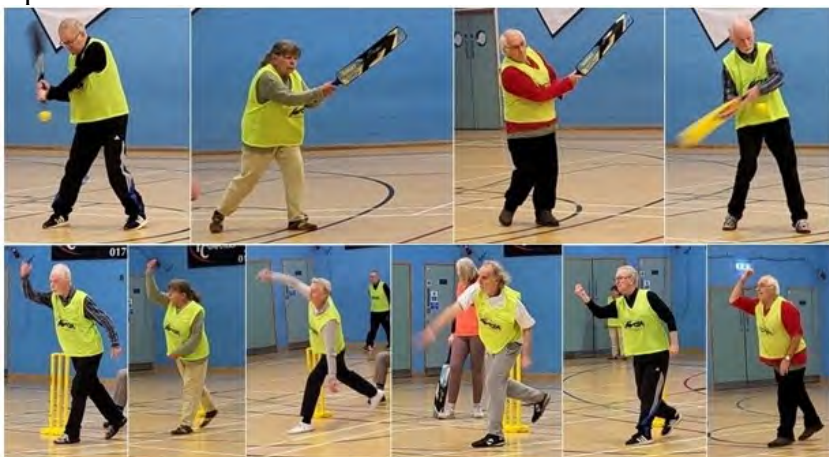
A SELECTION OF BATTING & BOWLING FROM 2023

The first game of the new year will be on the 11th January at the Todmorden Leisure Centre from 2 pm until 4 pm.