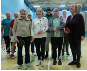
Table Tennis/Badminton meets every Monday during term time, at Todmorden Sports Centre, at 3:00 pm. Cost £3/session.

New flooring, members should check their footwear.