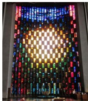
John Piper Window in Coventry Cathedral