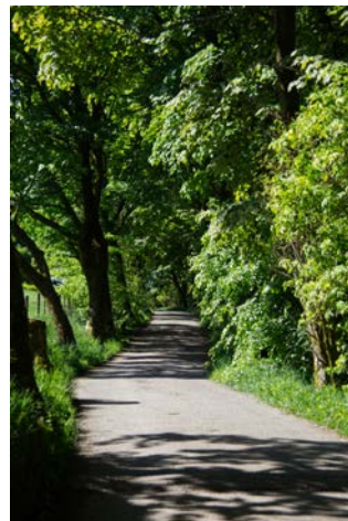
Shadows – Bill Griffith

Future practical sessions are for June a visit to Yorkshire Sculpture Park and July a guided tour of Barton Aerodrome. Both of which gives our members plenty of scope for capturing interesting images.