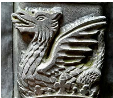
Downpipe Decoration - Dee Kerslaw

The topic for the month was "Shadows" which did pose some problems as there were few nice sunny days. We did however get some nice images.