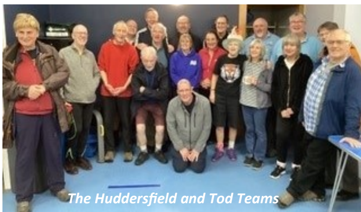
The Huddersfield and Tod Teams

Everyone retired to the studio for refreshments and a good chat. Many thanks to all those who brought sweet and savoury items for the social hour.