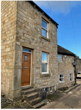
11 and 13 Pleasant View