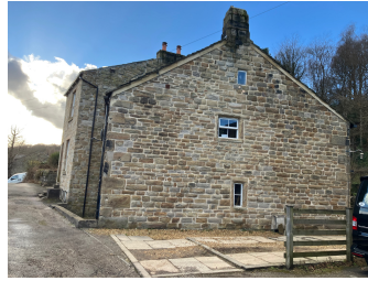
Side elevation of No 13