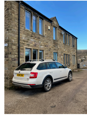
15 Pleasant View