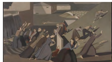
Winifred Knights – The Deluge