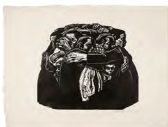
The Mothers - Kathe Kolwitz