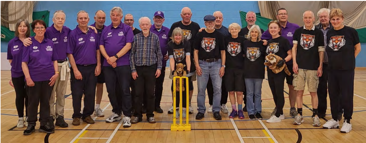
Leeds and the Tigers come together.

On the 3rd April the Leeds u3a team came to Todmorden and two of the Tiger's players gave their services to Leeds on the day to make the teams up to ten players. Nevertheless, the Tigers won a tight game by 18 runs.