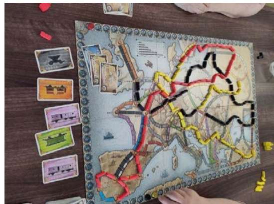
Ticket to Ride