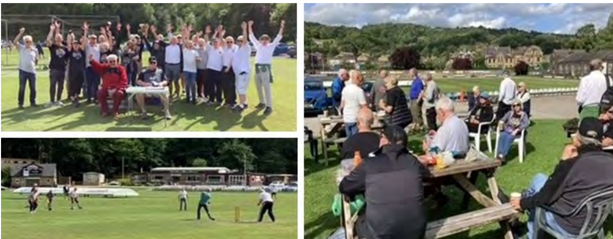
Scenes from the Oldham game

After 24 overs of good competitive cricket Oldham u3a set the Tigers 251 to win at Todmorden Cricket Club, but unfortunately they came up short by only 3 runs.