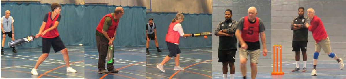
Members of the team playing at the Burnley game

A team of eight Tigers travelled to Nelson & Colne College on Thursday 24th July to play a new team formed by the Burnley FC charity 'Burnley in the Community'. The Tigers won by 113 runs to 109.