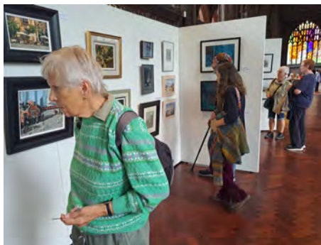
Art Appreciation members at MAFA Exhibition