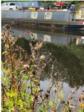
Cobwebs by the Canal