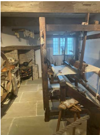
A framework weavers home

At the planning meeting, it was decided to make the August visit an informal affair, going to Calderdale Industrial Museum as individuals, rather than arranging a group tour. We opted to go on a Saturday, due to the limited opening days, and in the event 6 members of the group arrived at the agreed time and had an enjoyable afternoon visiting the upper floors. Whilst the top floor was a mixture of a work-in-progress exhibition of relatively recent textile machinery and a guest exhibition of the Bradford Model Engineering Society, the second and first floors held interesting exhibits of working textile machinery from local businesses. Several of these were operated and brought to life by knowledgeable volunteer guides who had worked with these machines during their working lives. The Jacquard Loom and Moquette loom were highlights for me.