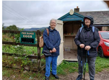
The Egg Honesty Shed