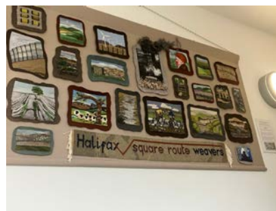
Halifax Square Root Weavers Panel