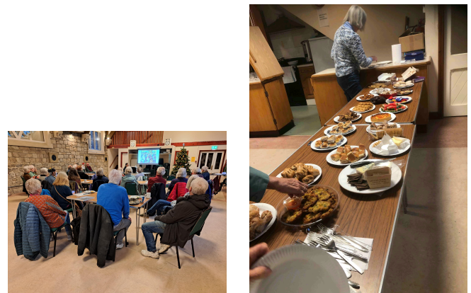
Figure 2: Art Appreciation: Buffet and presentation