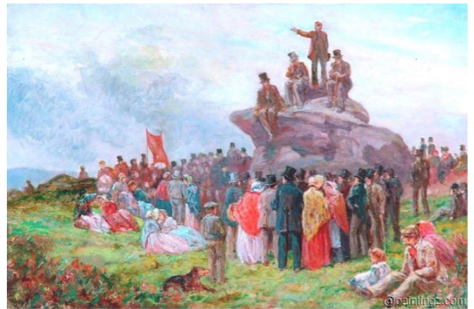
Figure 7: Local History: A Chartist Meeting at Basin Stones, Todmorden, 1842'

The session finished with Jim giving a brief introduction to the life and work of the local artist Alfred Walter Bayes (1831-1909). Discussion within the group highlighted the fact that there are more of his paintings in Todmorden Town Hall, all of local subjects depicted within his own lifetime, in contrast to the paintings of imaginary 17th century scenes which made his fortune down in London. Figure ?? shows the well-known painting 'A Chartist Meeting at Basin Stones, Todmorden, 1842'.