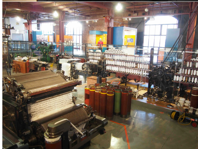
Figure 11: Social History: Famous 5 go to a museum

I enjoyed yesterday looking at so much of the machinery. I wondered how, "in the old days" all this was made without computers, laser cutting machines and modern technology.