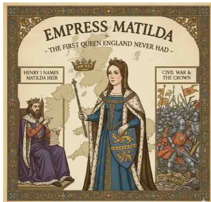
Figure 9: Online Zoom Talk scheduled for 8th January

talk looks at her claim to the crown and the civil war that it caused. A link to join the session will be sent out on Monday