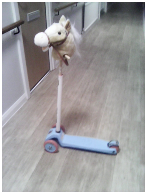
Figure 4: Concert Party: Scoot, a snow-white, pure-bred mare

We will be at the Age Concern Coffee Morning on 17th December, and then have a break until the beginning of February 2026 during what should be the worst of the winter weather.