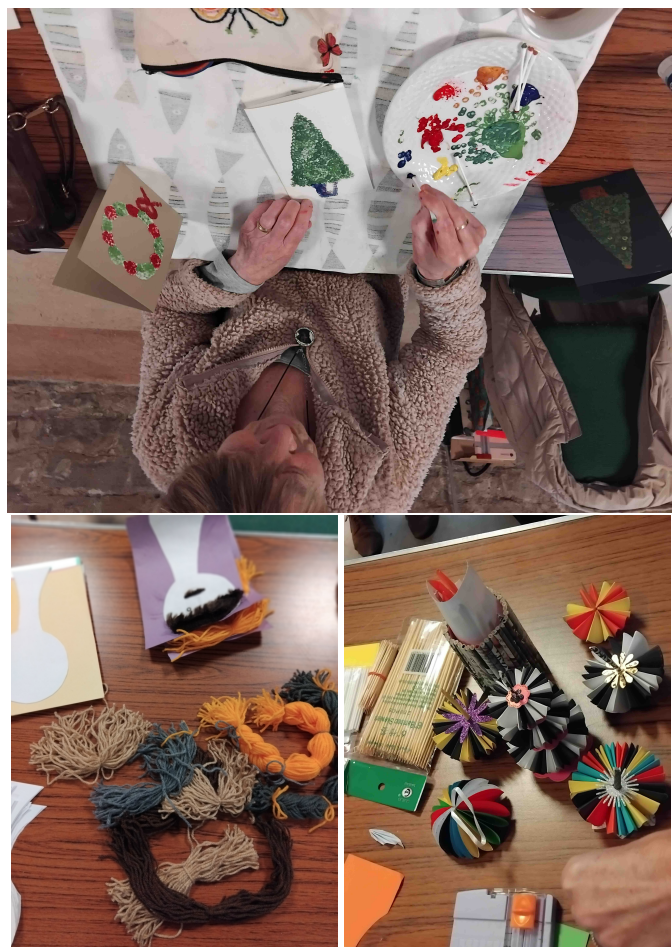
Figure 5: Craft Club: Painting with cotton buds, KidsFest and Diwali

Our last session in 2025 was very busy as we finalised plans for Kidsfest, made Diwali candles, exchanged Secret Santa gifts and had an end of 2025 celebration with food, mulled wine and lots of chatting.