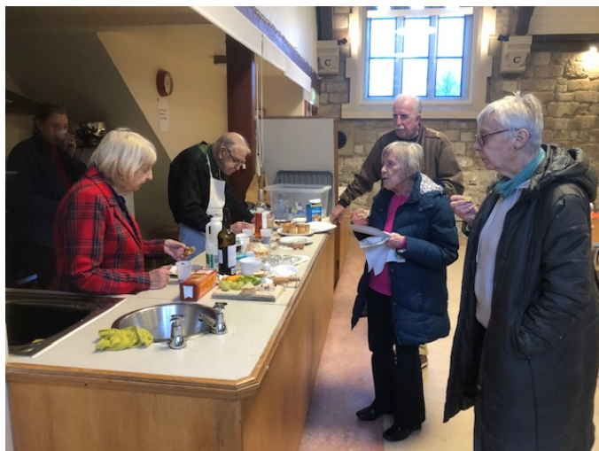
Figure 3: Art Club members at the December meeting

over the last few months before enjoying a festive buffet!