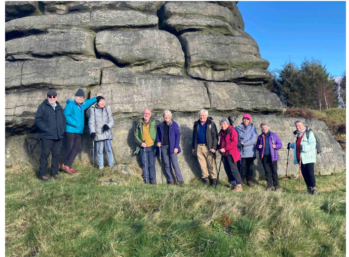
Figure 13: Walking Group members at Great Rock

The Walking Group currently meets on the last Tuesday of each month (except December) and details of each walk are sent out in advance by email to all Group Members and posted in the website calendar. Membership of the group is open to all current members of U3A Todmorden and enquiries about the group, or requests to join, should be sent to the Group Convenor through the Walking Group's entry in the u3a Todmorden website ( u3atod.org.uk ).