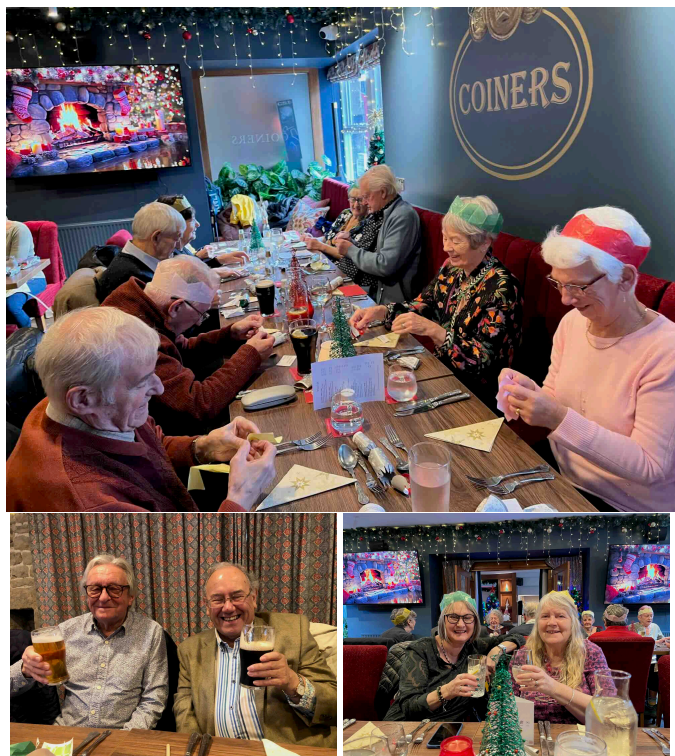
Figure 8: Lunch Club at the Dusty Miller

But that has not prevented us having a good time and for new members to have got their feet under the tables, their hands on the handbook, and their heads round the scoring system.