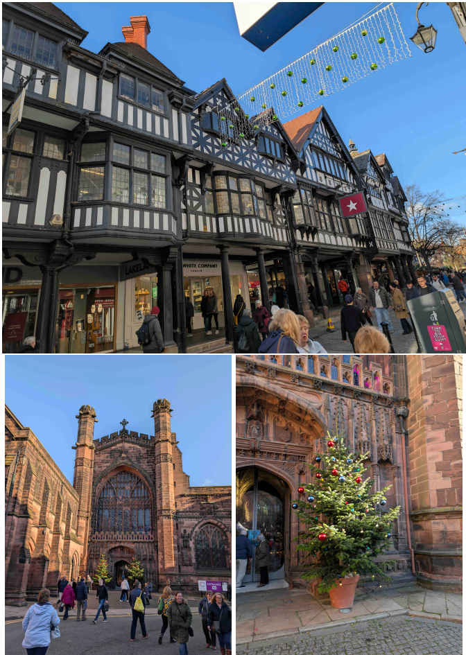
Figure 6: Let's Go to Chester

The idea behind the new format is to allow members who wish to look into local history the time to do it, and it offers those who wish to listen to talks on local history the facility to access these subjects.