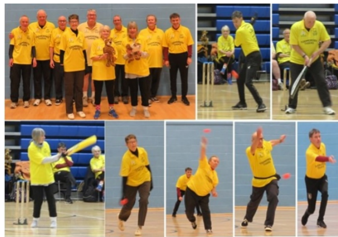
Figure 12: Walking Cricket: Team wearing new strip

On Wednesday 26th November the Tod Tigers went to play Oldham u3a and came back victorious winning by 12 runs. Below is the whole team in their new strip and some individual performances.