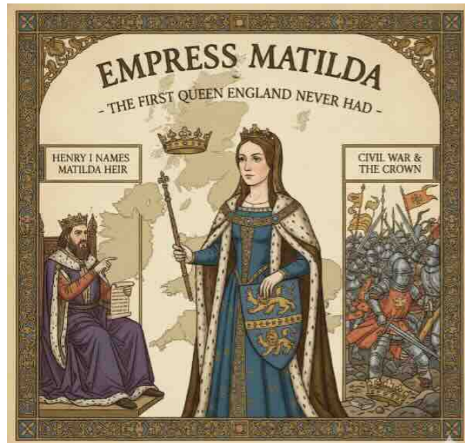
Figure 9: Online Zoom Talk scheduled for 8th January