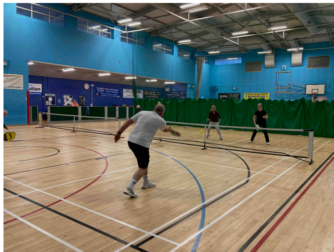
Figure 10: Pickleball - new nets at Todmorden Sports Centre

The Sports Centre have now purchased pickleball nets, more balls & paddles which we are more than happy with. All you need to start are sports shoes suitable for indoor use and comfy clothes.