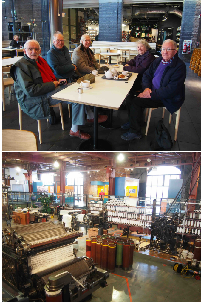
Figure 11: Social History: Famous 5 go to a museum