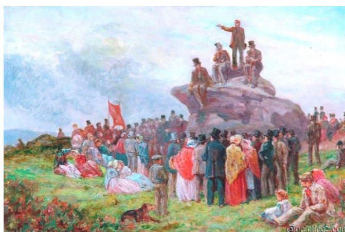
Figure 7: Local History: A Chartist Meeting at Basin Stones, Todmorden, 1842'

The idea behind the new format is to allow members who wish to look into local history the time to do it, and it offers those who wish to listen to talks on local history the facility to access these subjects.