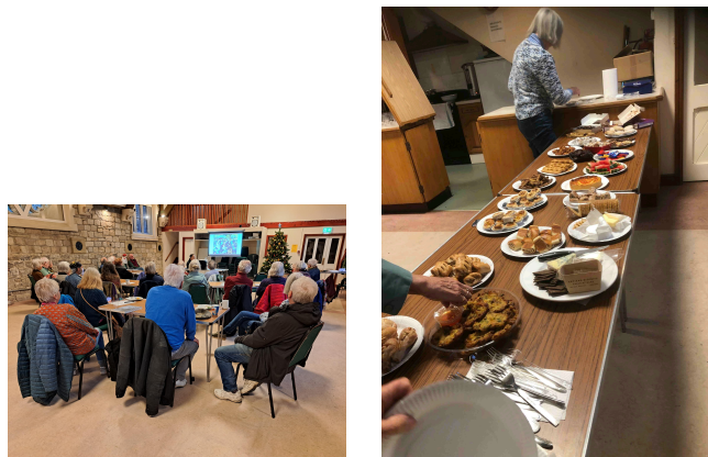
Figure 2: Art Appreciation: Buffet and presentation

Submit 3 of your favourite painters. A lucky dip is held and all of those who submitted are given one of the submissions from which one artist is chosen. Research on that artist is done and a presentation given as a present to the submitter. And there we have our version of Secret Santa. A thoroughly enjoyable afternoon made even better by a lovely buffet to which we all contributed.