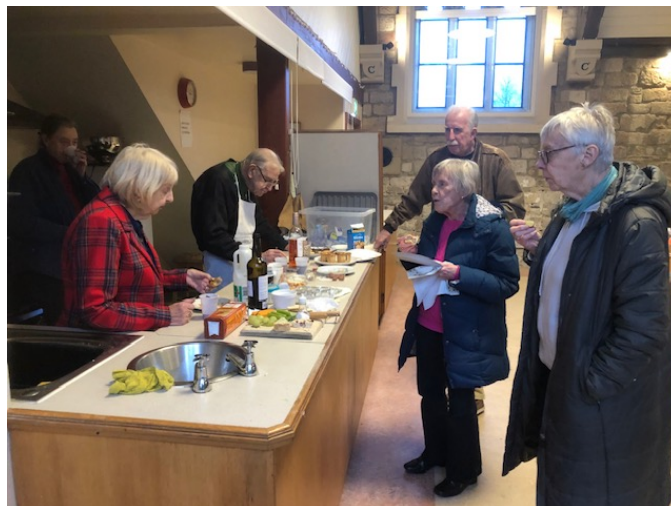
Figure 3: Art Club members at the December meeting

At our last meeting of the year members took the opportunity of looking at some of the work the group had created over the last few months before enjoying a festive buffet!