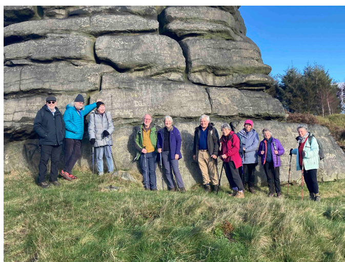
Figure 13: Walking Group members at Great Rock

The Walking Group currently meets on the last Tuesday of each month (except December) and details of each walk are sent out in advance by email to all Group Members and posted in the website calendar. Membership of the group is open to all current members of U3A Todmorden and enquiries about the group, or requests to join, should be sent to the Group Convenor through the Walking Group's entry in the u3a Todmorden website ( u3atod.org.uk ).