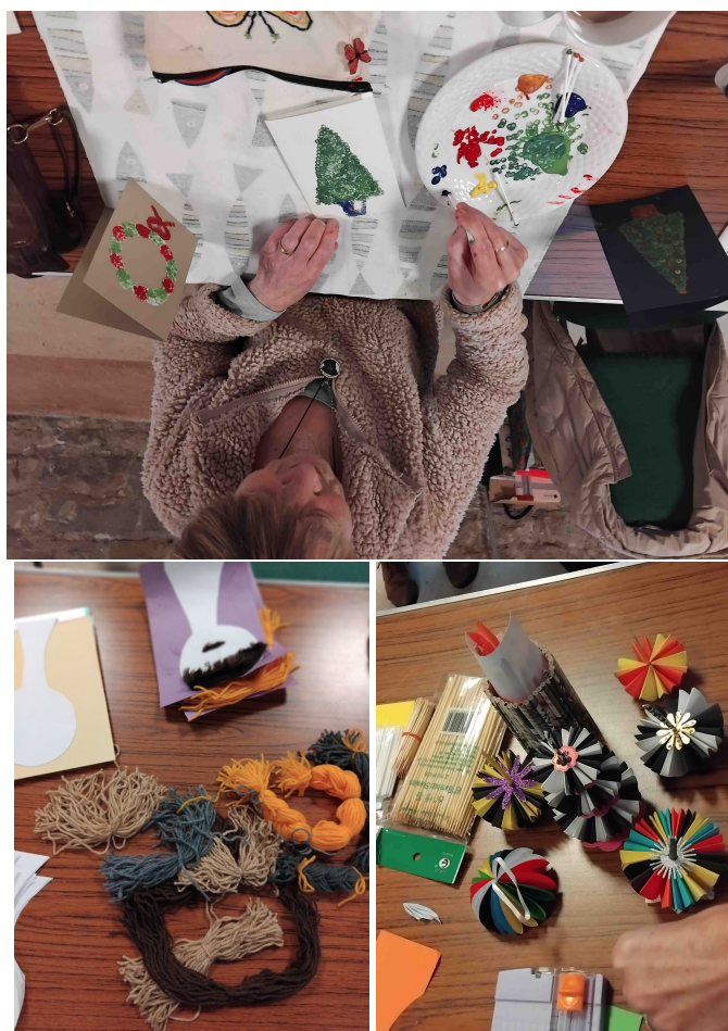
Figure 5: Craft Club: Painting with cotton buds, KidsFest and Diwali

On November 28th we tried out some simple techniques to 'paint' designs for use in card making without using a brush. Attractive and useful results were achieved by Club members who declared that 'they couldn't paint or draw' as well as the experienced painters. As some of the group were due to attend KidsFest in December