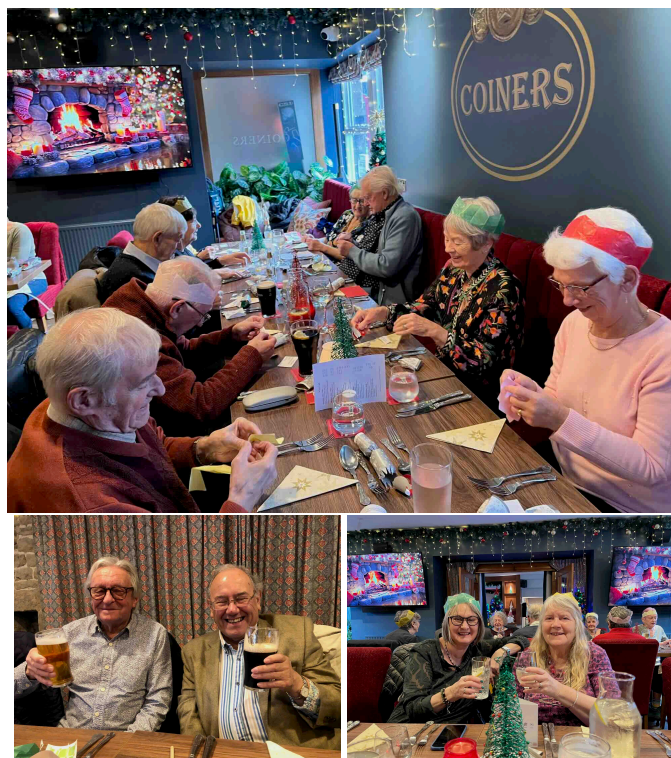
Figure 8: Lunch Club at the Dusty Miller