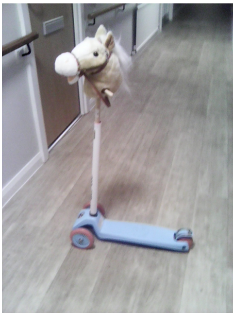
Figure 4: Concert Party: Scoot, a snow-white, pure-bred mare

We will be at the Age Concern Coffee Morning on 17th December, and then have a break until the beginning of February 2026 during what should be the worst of the winter weather.