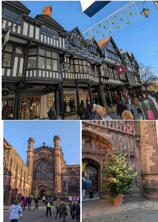
Figure 6: Let's Go to Chester

We had a good day out on a bright, sunny day (despite some members not being able to come due to our appalling bus service, and the virus doing the rounds just now).