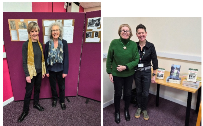
Figure 7: Speakers at "Women of the Calder Valley"