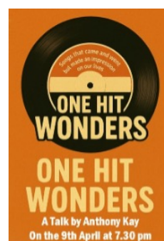
Figure 8: Our next online talk