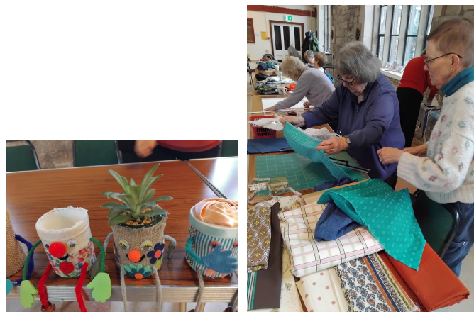
Figure 5: Craft Club upcycling pots

The members met on February 20th to recycle empty pill pots into useful items. The majority made storage containers which resembled ‘Dusty Bin’ from the TV programme but some made plant pot covers which using fabric and artificial leaves/flowers.