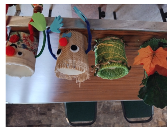
Figure 6: Craft Club - pots with fabric covers

The following session was the first part of two (second will be on April 17th) in which a decorated shoulder bag will be made. The fabrics were selected, cut out and prepared for sewing.