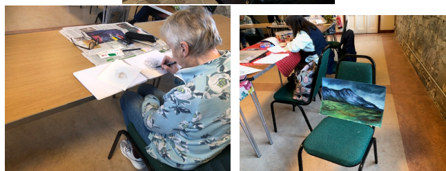
Figure 4: Works by Art Club members

We meet alternate Wednesdays between 2 and 4pm at Fielden Hall the next ones being on the 18th March and 1st April. The Group is looking to recruit new members and anyone interested is very welcome to come along for a trial session to see if it's right for them. For further details contact Judith Malone on 01706812890.