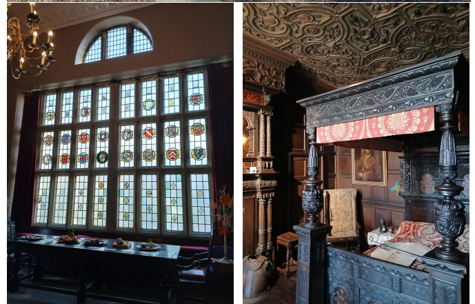
Figure 1: Alfresco History visit to Bolling Hall, Bradford

Whilst the visit was self-guided, there were plenty of interpretation boards throughout, and we were well informed about the successive owners, and the part played by the house in the English civil war.