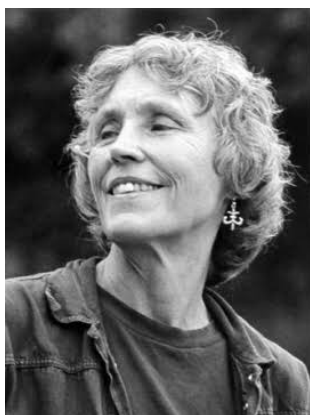
Figure 2: Fay Goodwin

We were going to show a film about the photographer Trish Murtha but despite many pre meeting trials our convenors couldn't get this to play and it was substituted for a film about Fay Godwin. A splendid substitute as it turned out.