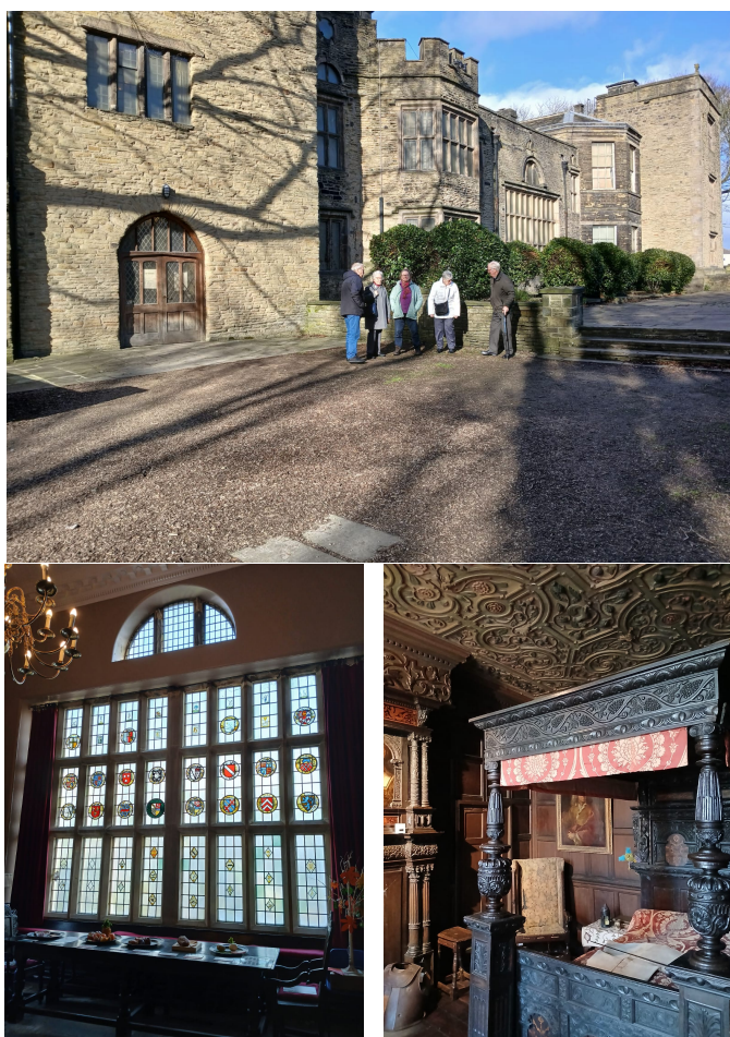
Figure 1: Alfresco History visit to Bolling Hall, Bradford