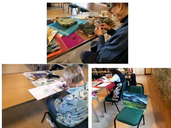
Figure 4: Works by Art Club members

Art Club does not provide tuition but does give members plenty of mutual support, encouragement and advice as well as the opportunity of exploring their own ideas and projects in a variety of techniques and media from collage to watercolor and water-soluble oils. From time to time the convenor will suggest a topic by way of inspiration which can often be interpreted widely and freely. The current topic is “Distant Lands”. There is an emphasis on the group being an opportunity for the members to be creatively playful and to experiment and to learn from each other. Over the next few months members will spend a portion of some meetings sharing techniques and topics of particular interest.