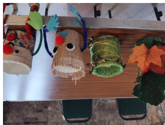
Figure 6: Craft Club - pots with fabric covers

night in a hotel run by Nuns. Only on leaving did they realise they'd spent the night in an old peoples home, and wondered what happened to the room's previous occupant. In March, the themes are 'Spring' and 'Marching Orders', and our first meeting of the month was well attended.