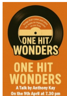
Figure 8: Our next online talk