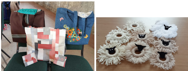
Figure 4: Craft Club: shoulder bag and curtain-ring sheep

On April 17th the task was to complete the shoulder bags which were started earlier in March.