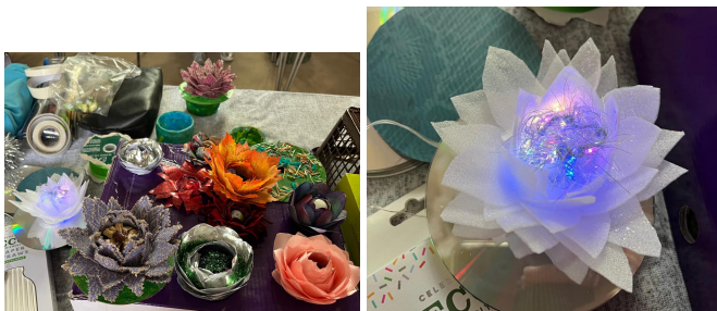
Figure 5: Craft Club: response to challenges

The session on May 15th (postponed from May 1st) was the challenge to take a simple technique for making flowers and develop it using various materials including papers, foil, fabric, plastic packaging, Mylar (helium balloon material) etc. and possibly finding new items that can be made using the technique. Some of the items produced included air freshener holders, T light holders from plastic wrapping, foil and pinecone flowers for outdoor display, painted canvas T light holders.