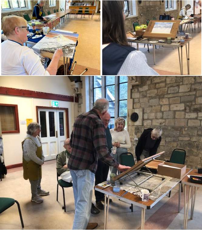
Figure 2: Art Club