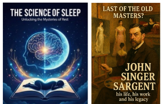
Figure 8: Online Zoom Talks