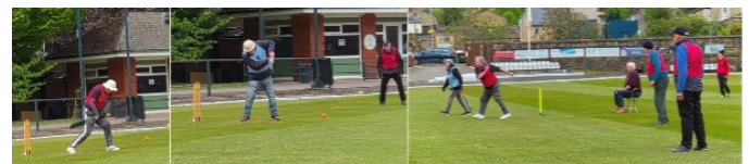
Figure 9: The group in action at Todmorden Cricket Club.

The group have now moved outside for our sessions and these are taking place on Thursday afternoons at Todmorden Cricket Club