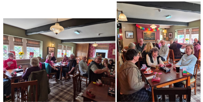
Figure 3: The group in action at a Tuesday session

We have been continuing our sessions on a Tuesday afternoon at the Hare & Hounds public house and the group continues to improve and the group continues to enjoy the sessions. Anyone who wants to join the group please contact