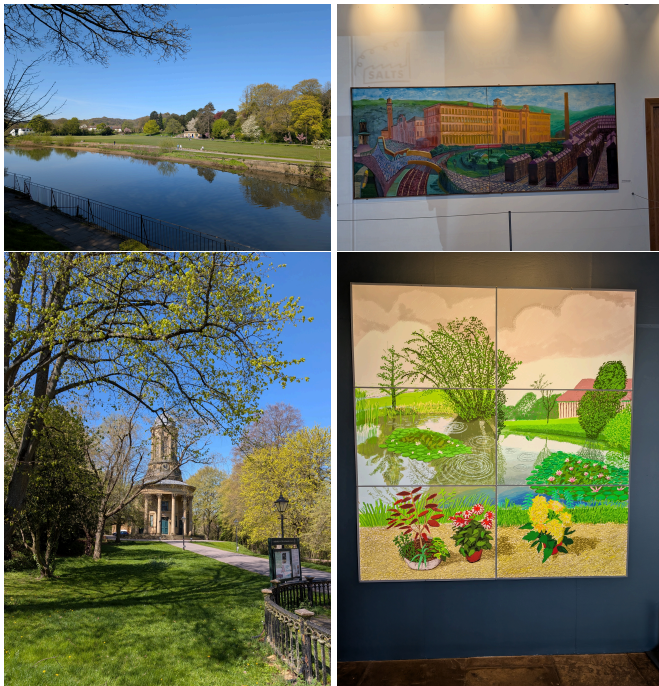
Figure 7: Let's Go to Saltaire

were lots of David Hockney paintings along with shops and cafes. Some photos are in Figure 7.