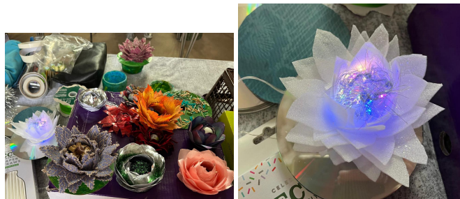
Figure 5: Craft Club: response to challenges

The session on May 15th (postponed from May 1st) was the challenge to take a simple technique for making flowers and develop it using various materials including papers, foil, fabric, plastic packaging, Mylar (helium balloon material) etc. and possibly finding new items that can be made using the technique. Some of the items produced included air freshener holders, T light holders from plastic wrapping, foil and pinecone flowers for outdoor display, painted canvas T light holders.