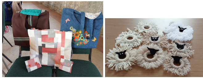
Figure 4: Craft Club: shoulder bag and curtain-ring sheep

On April 17th the task was to complete the shoulder bags which were started earlier in March.