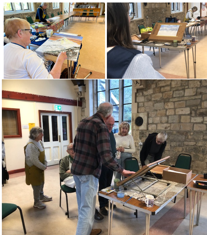
Figure 2: Art Club