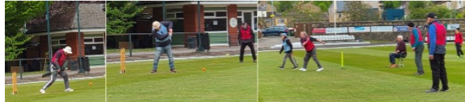
Figure 9: The group in action at Todmorden Cricket Club.

The group have now moved outside for our sessions and these are taking place on Thursday afternoons at Todmorden Cricket Club