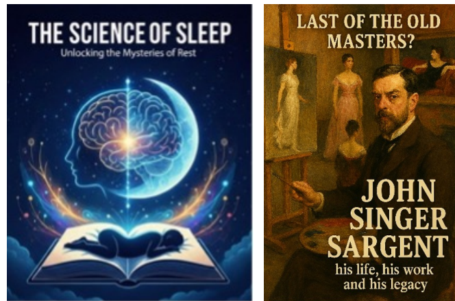
Figure 8: Online Zoom Talks