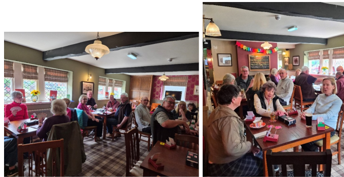
Figure 3: The group in action at a Tuesday session

We have been continuing our sessions on a Tuesday afternoon at the Hare & Hounds public house and the group continues to improve and the group continues to enjoy the sessions. Anyone who wants to