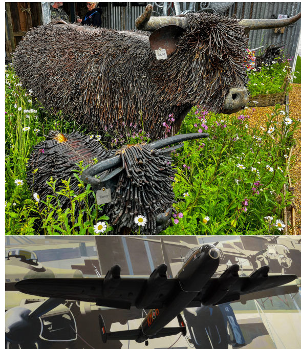
Figure 8: Photography - images from flower show and aircraft museum

Planning is well underway for our Autumn Challenge where the Group are given a list of 15 topics and the challenge is to submit 1 digital image to each topic in our January meeting. Some of the topics are easy, others need some thinking about and the odd one needs a lot of thinking about which is a real challenge.