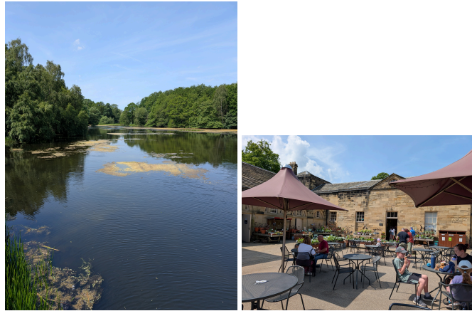
Figure 5: Nostell Priory and grounds

Many members enjoyed walking around the lake and grounds as well as visiting the house and the wonderful interior. It was also lovely to enjoy lunch in the Courtyard. Our next trip is to Scarborough on June 24th, and there will not be a trip in July. The August trip will be to the Southport Flower Show - or just Southport depending on what people prefer.