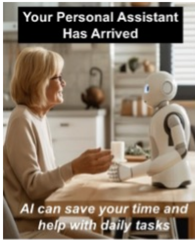
Figure 7: Online Zoom Talk: What Can AI do For Me