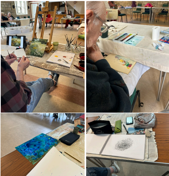
Figure 2: Art Club

and Splendor, accompanied by free hot drinks and cold biscuits. If you think you might be interested in exercising your brain-cells in different ways of thinking while also having fun, you don't need to know any of the rules to join in, and you can always drop by when we're meeting, or else contact the convenor in advance, Jim Botten at jroyd33@gmail.co or telephone on 01422 844987.