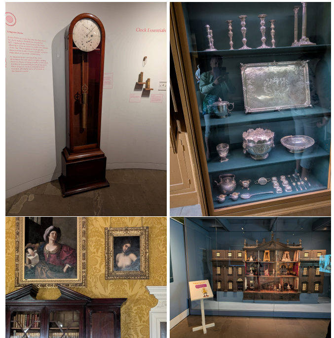
Figure 6: Nostell Priory interiors