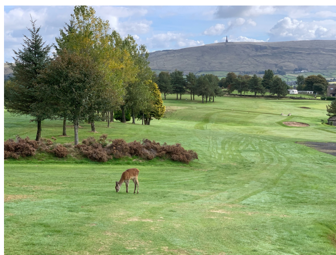
Figure 4: Golf for fun