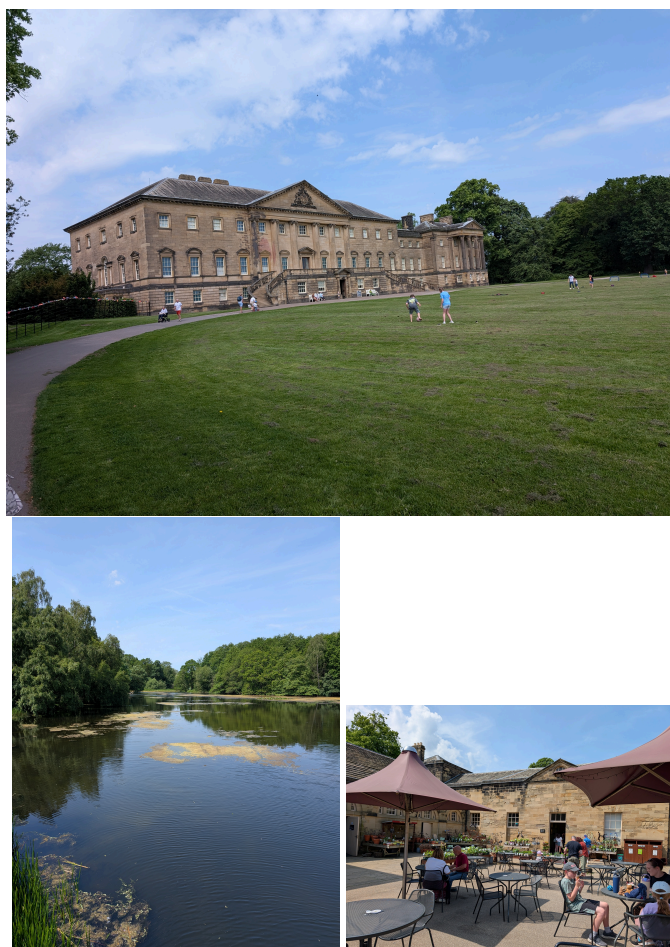
Figure 5: Nostell Priory and grounds

previous few days was tempered by a slight breeze which made it more enjoyable.