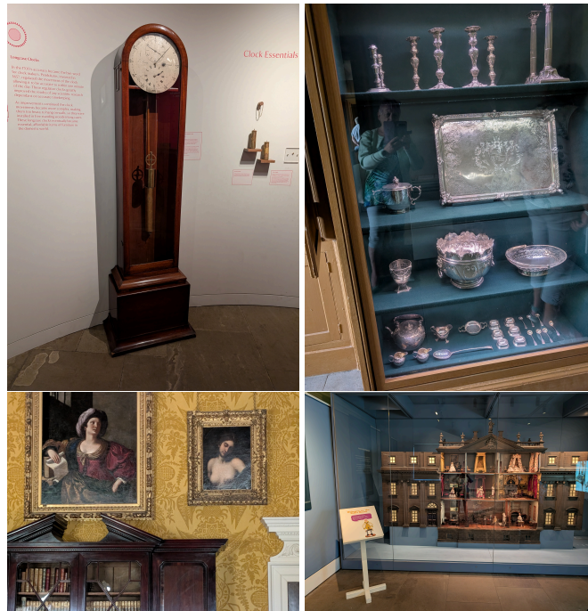
Figure 6: Nostell Priory interiors