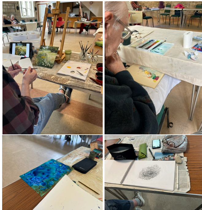
Figure 2: Art Club

Both results were impressive, but appeared to be resource consuming. We also had a brief look at the inner workings of algorithms that search a graph, as in route-finding. New members will be welcome at our next meeting at our regular slot of 1:00 pm on the second Monday (August excepted) in Tod College.