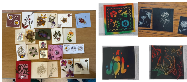
Figure 3: Craft Club