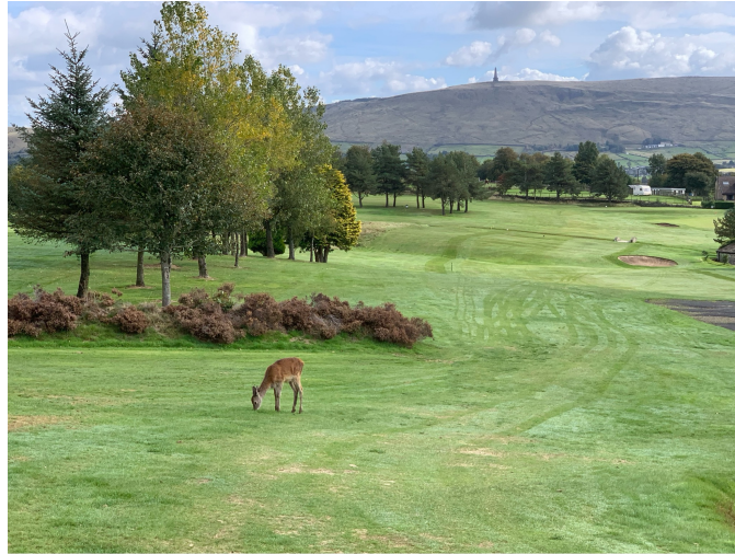
Figure 4: Golf for fun