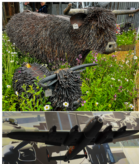
Figure 8: Photography - images from flower show and aircraft museum

The Photo group has been pretty active in the last couple of months with photo trips to the Avro aircraft museum, April Bank holiday week in Thompson Park Burnley and a visit to the annual Yorkshire Photographic Union exhibition.